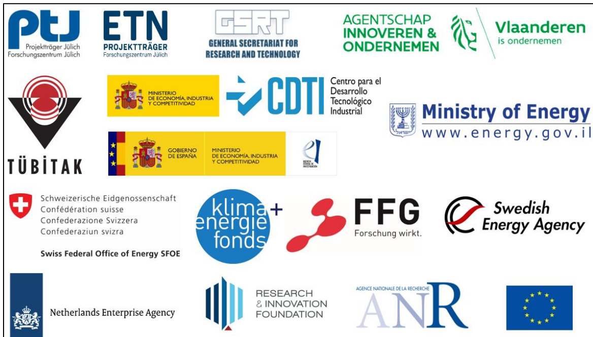
Figure 1: Organisations involved in promoting the SOLAR-ERA.NET Cofund 2 Additional Joint Call and providing support and funding to innovative transnational projects.

The participating national SOLAR-ERA.NET partners / contact points are listed in Table 1. Applicants are strongly encouraged to check the project idea and specific requirements with the national / regional contact point as early as possible in the preproposal phase.